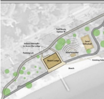
Lake Max Amphitheater Grant Awarded