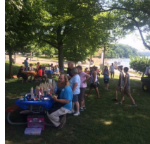
Lighter, Quicker, Cheaper Projects Discussed