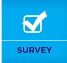
Stellar Survey Results