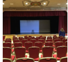
Delphi Opera House Renovations Inspire Culver Efforts